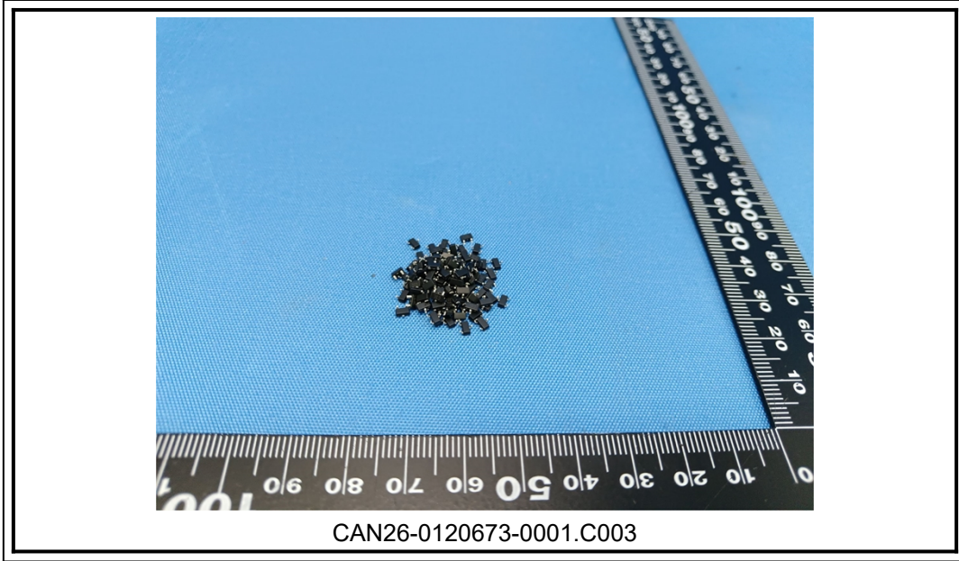
此照片仅限于随 SGS 正本报告使用 ***报告结束***